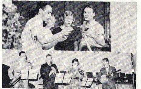
Mixed quartet above with 5/7 of Ambassador Jazz Band below.

The audience laughed, clapped, and showed their appreciation by giving a giant donation of $781.71.